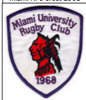
Miami RFC Crest 1968